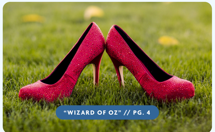
"WIZARD OF OZ" // PG. 4