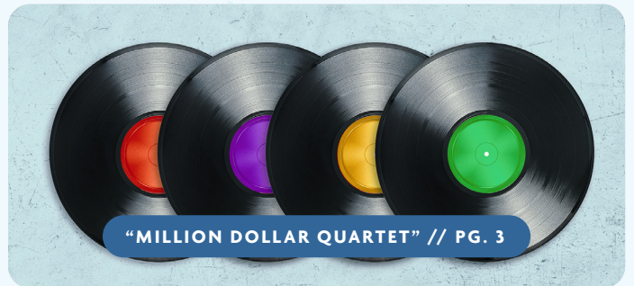
"MILLION DOLLAR QUARTET" // PG. 3